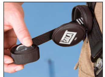
Suspension Relief Straps