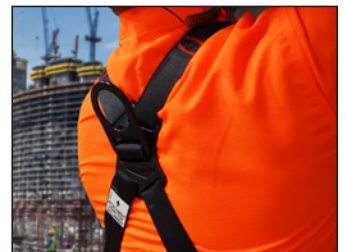
Large rear fall arrest point