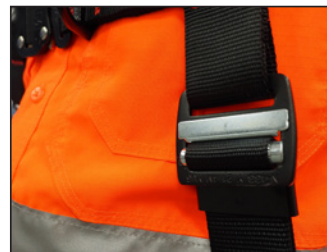
Easy to adjust torso buckles